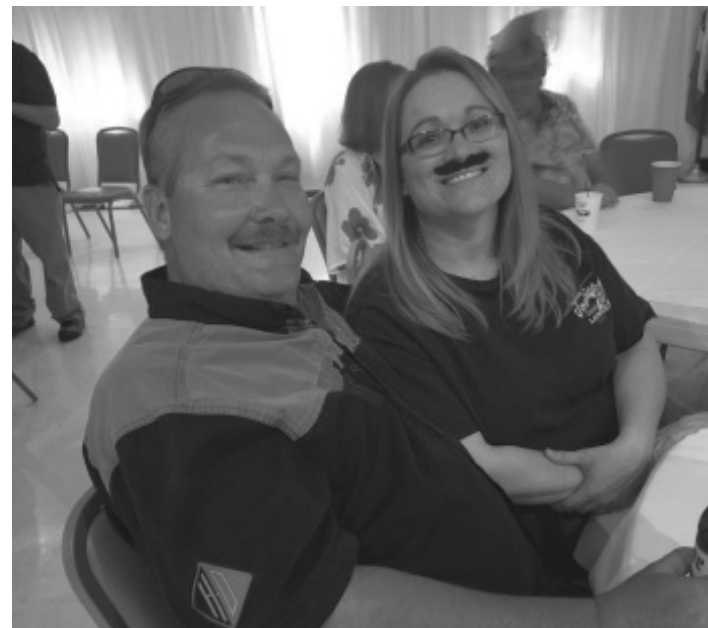
Lucas County Shriner and lady enjoying the Night.