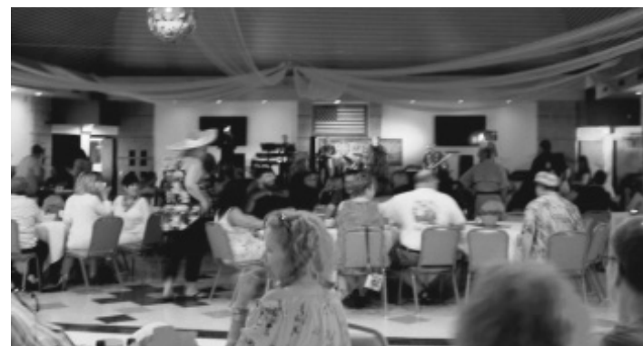
A few of our Shriners and their ladies enjoying the party and the Compass Rose Band.