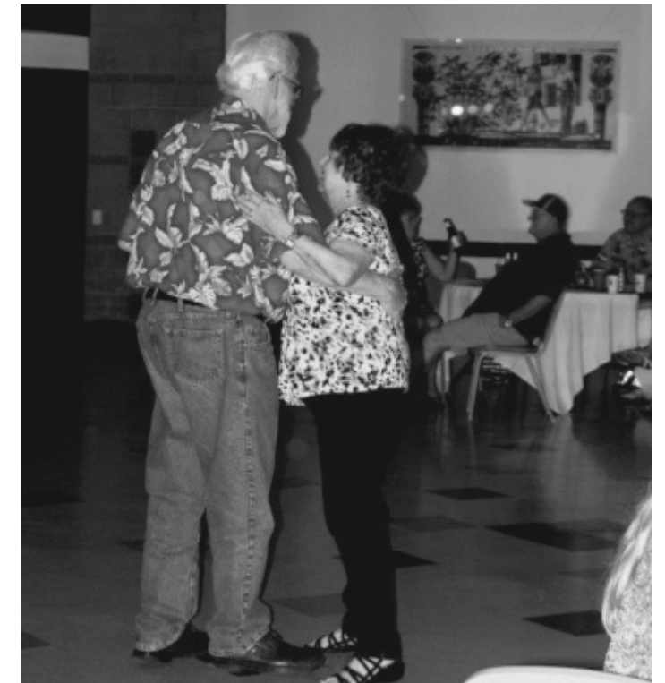
Dancing to Compass Rose Band.