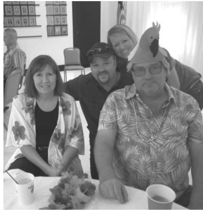
Our Big Parrott head winner for the guys!!