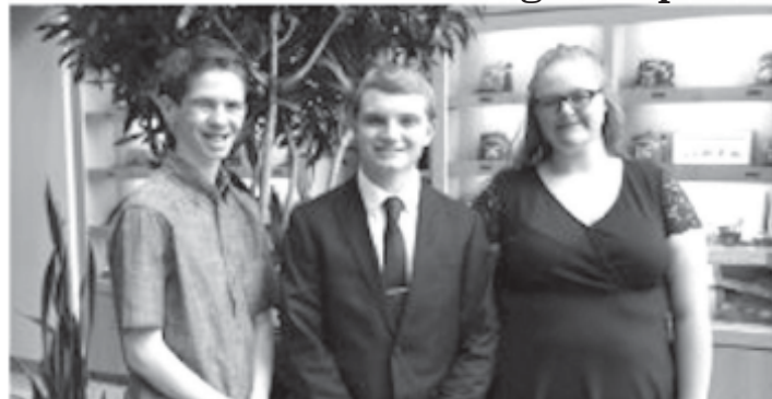
2017 Rainbow of Hope Winners

Do you know a current and/or former patient at least 12 years of age who you believe is a role model for others? If so, please nominate them today!