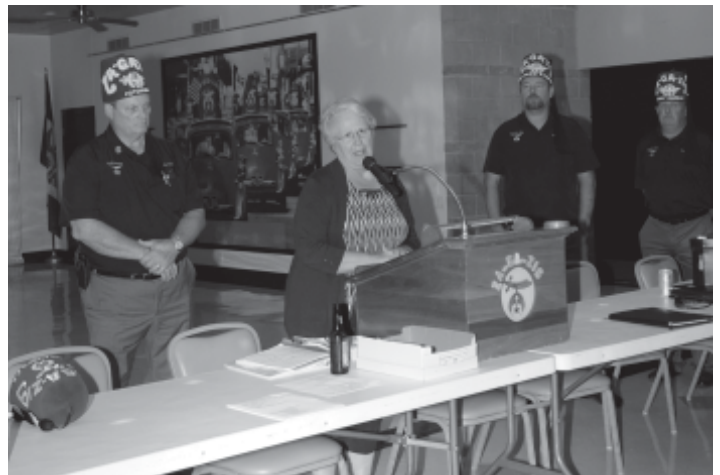
Eastern Star representative who is part of the ladies who make and present the "Quilts of Valor".