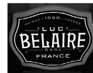
Luc Belaire Lighted Bar Sign

Tickets are ONLY 6 for $5.00 available from any Sportsman's member Drawing to be held Friday April 19th (Good Friday) at the 4th Annual Sportsman's / Tux & Greeters Fish Fry at the Shrine Center Need not be present to win