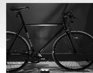
Luc Belaire Promotional Bicycle