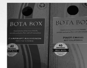
Bota Box Bag Game