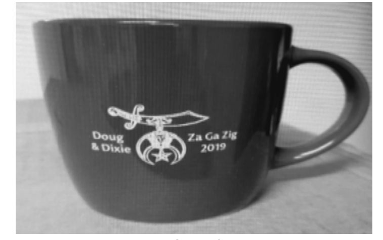
2 for $5 All proceeds benefit the general fund. See the Potentate