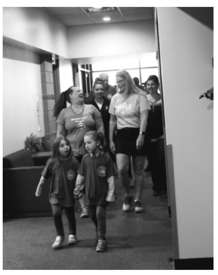
Za-Ga-Zig Hunter Safety Education Course was also held on Saturday, June 22

Nobles, we have reviewed our list of members who have still not paid there 2019 dues. Unfortunately, there are 106 on that list. We are half-way through the year with about $10,500 dollars outstanding that could be helping your Temples budget. IF you are in a bad way financially, medically, or some other situation that is stopping you from paying your dues, please call, email or text, one of your Divan Officers, so that we can try to help you out. There is no reason that we should drop anyone from our membership.