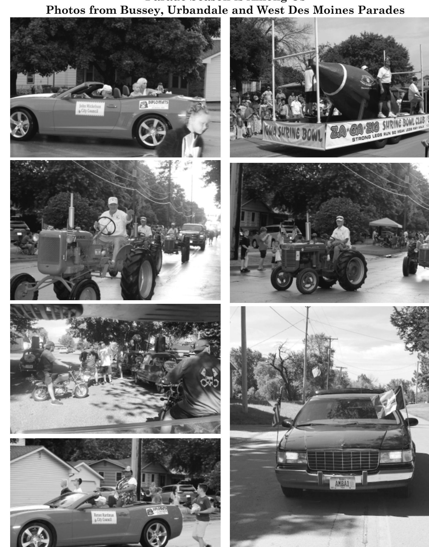
Parade Season is Among Us Photos from Bussey, Urbandale and West Des Moines Parades