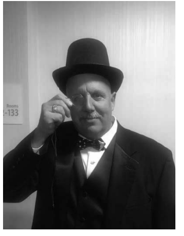
Mark your calendars The Champagne & Chocolate Auction is on Saturday, September 28th on Shriners Parkway. Doors open at 5:30 p.m. with "Free Parking."

Now is the time for clubs & units to start getting their donations ready. Donations with a value of $200 or more receive a table for 8 (maybe on Circus Avenue). You also get to Pass Go with 8 drink tickets for your table to be used that night in the Oasis.