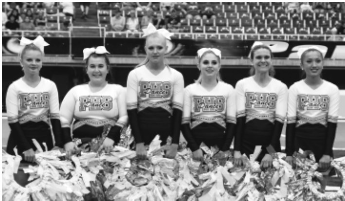
2019 Pleasantville Dance Team