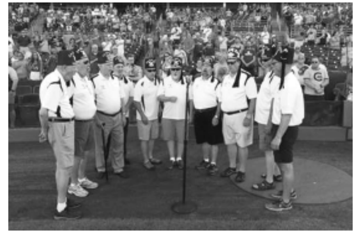
Thanks to everyone for participating.