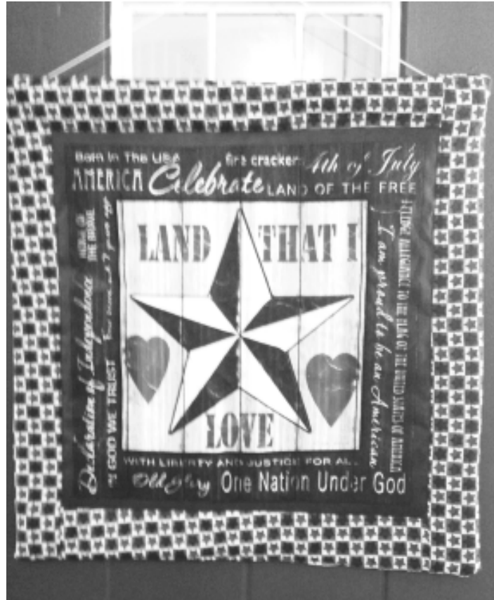
The door hangers 20" X20" for $10