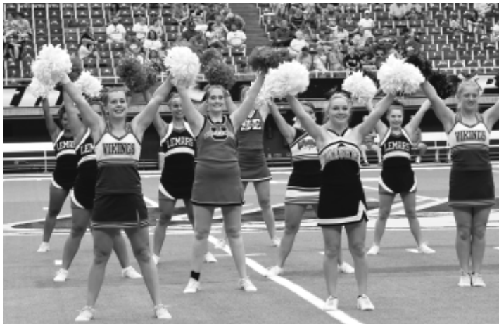
2019 Shrine Football Cheerleaders