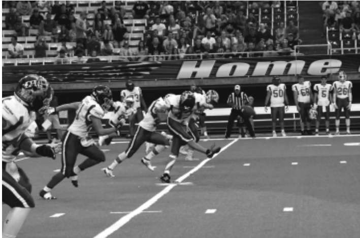
Kick-off of the 2019 Iowa Shrine Bowl