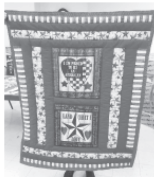
Lap Quilt approximately 38" X 49" - $50

If you are interested in buying one or both, please contact Cindy at 515-979-9395.