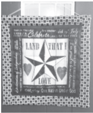
The door hangers 20" X 20" - $10