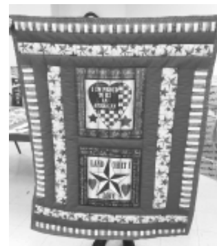
Lap Quilt approximately 38" X 49" - $40

If you are interested in buying one or both, please contact Cindy at 515-979-9395.