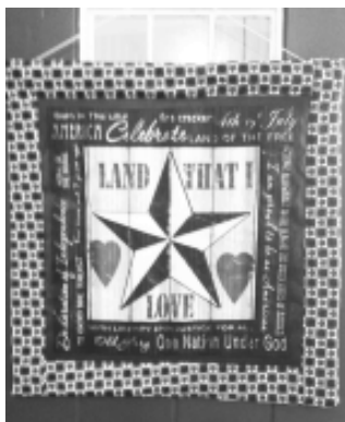
The door hangers 20" X 20" - $10