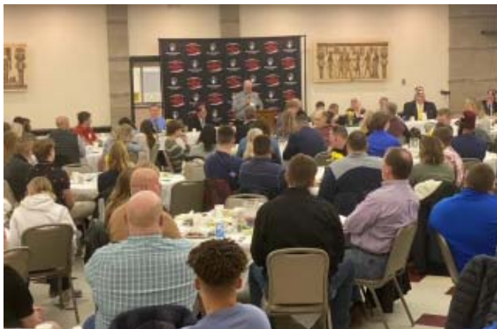
Za Ga Zig Recognition Dinner