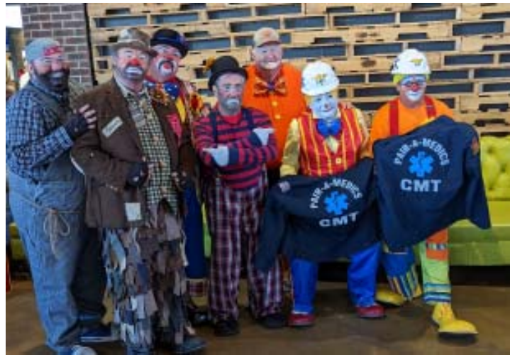
2 nd Place Unit Skit with the Teeter Board.