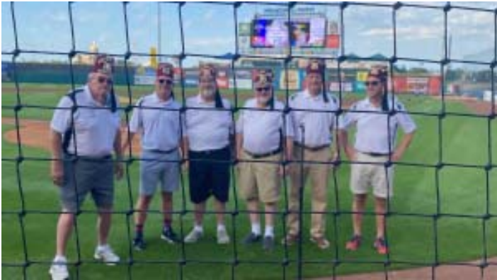
The Za Ga Zig Shrine Chanters performed before a large crowd in July at an Iowa Cubs baseball game. Our Legion of Honor also participated.