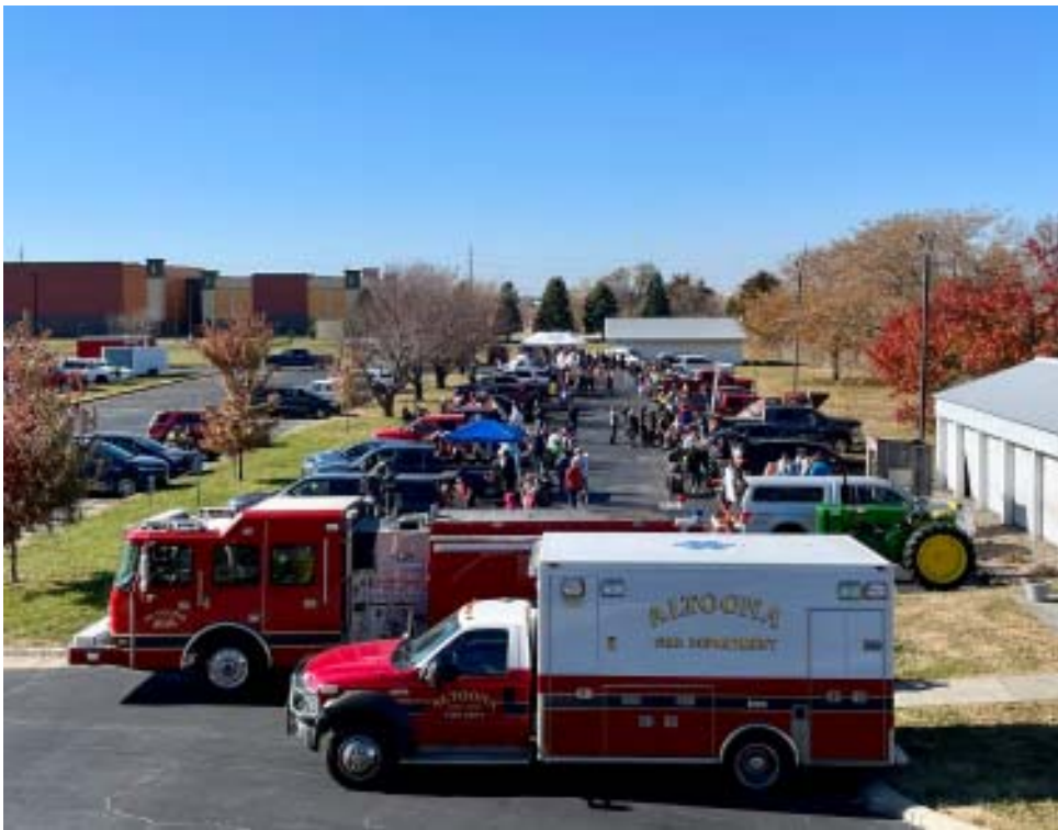
October 29, 2022 was a great day for the Za-Ga-Zig "Trunk or Treat". A combination of 26 units and clubs participated in a marvelous Halloween event.