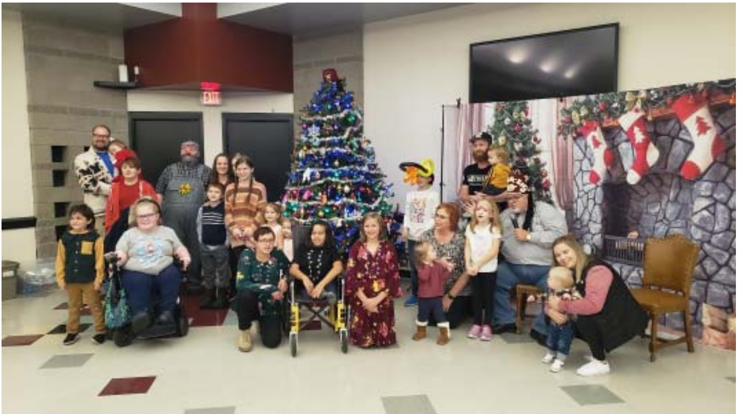
Za-Ga-Zig Shrine Children's Christmas Party