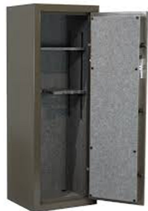
Sports Afield 20 Gun Safe