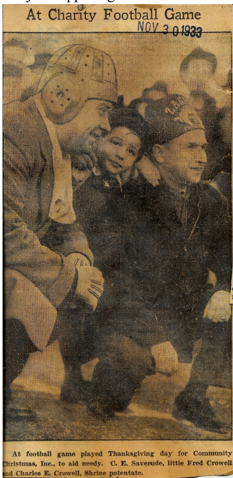
At Charity Football Game NOV 3 0 1933