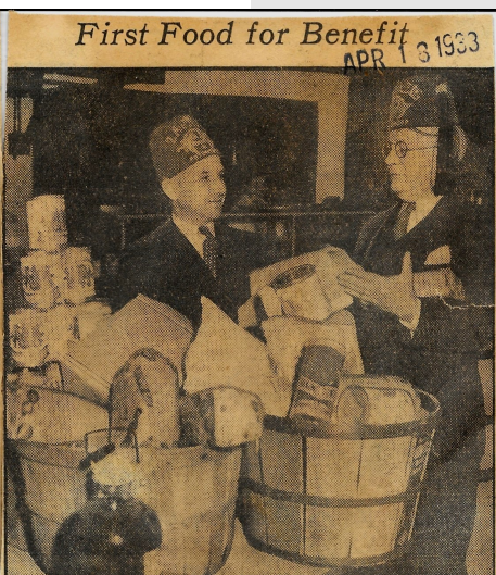
First Food for Benefit APR 13 1933