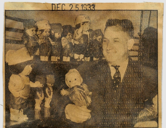
DEC 25 1933

Packages or sacks of nonperishable foods will provide admission for anyone. All food will be given the Des Moines Women's Relief association for use in its soup kitchens. The Valley Junction High school band will play.