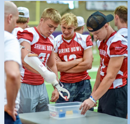
North Team participating in "Hospital Experience" activities at the Beyond the Field Camp!