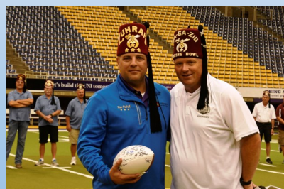
Half Time Awards