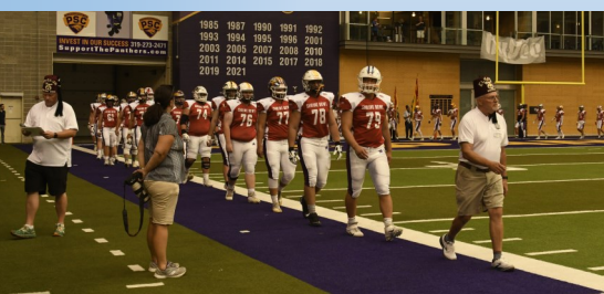
Players coming on the field.