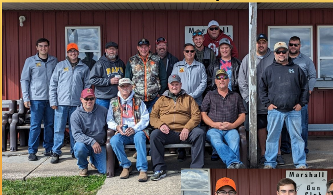
was held at Marshall Gun Club on October 7th.