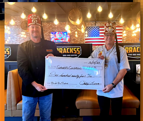
check presentation (10-14-23).