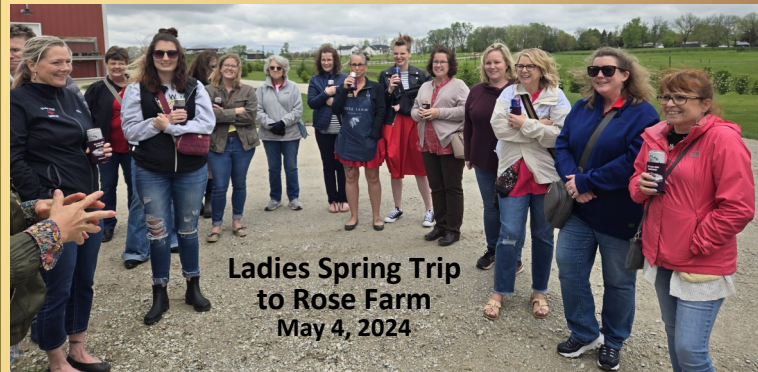
Ladies Spring Trip to Rose Farm May 4, 2024