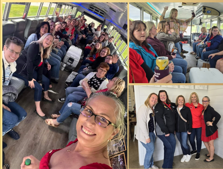
Trike Patrols Thanks everyone who attended our Taco Dinner on April 26th!