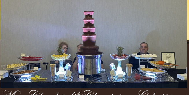
More Chocolate & Champaigne Gala pictures from front page...