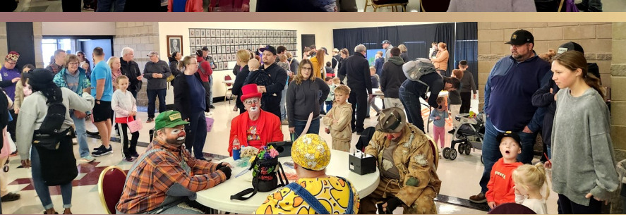
April 19, 2025