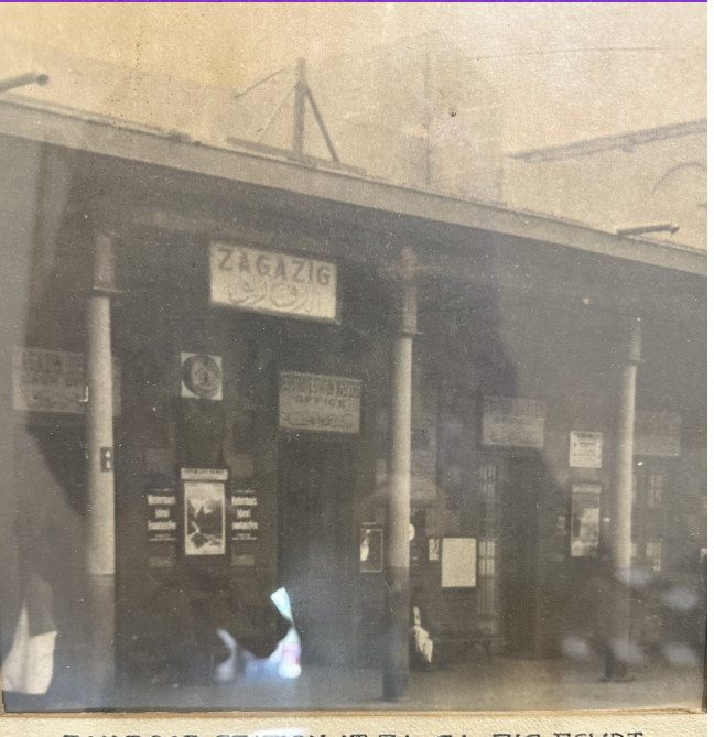
RAILROAD STATION AT ZA-GA-ZIG, EGYPT